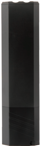
Osprey 9 2.0